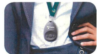
On a Lanyard