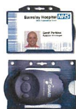
ID Badge Holder

MySOS Emergency is so small and lightweight it can be carried conveniently and discreetly, in a variety of different ways.